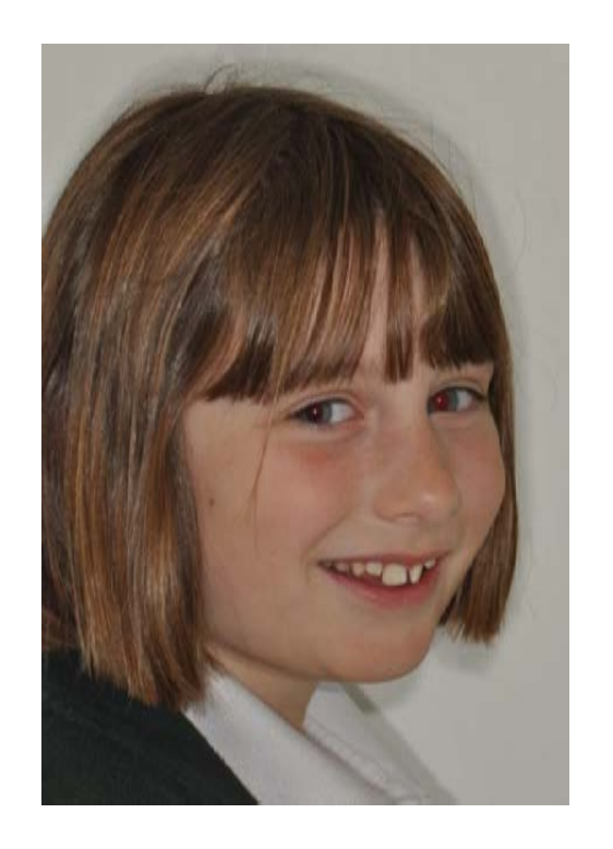
8 years old